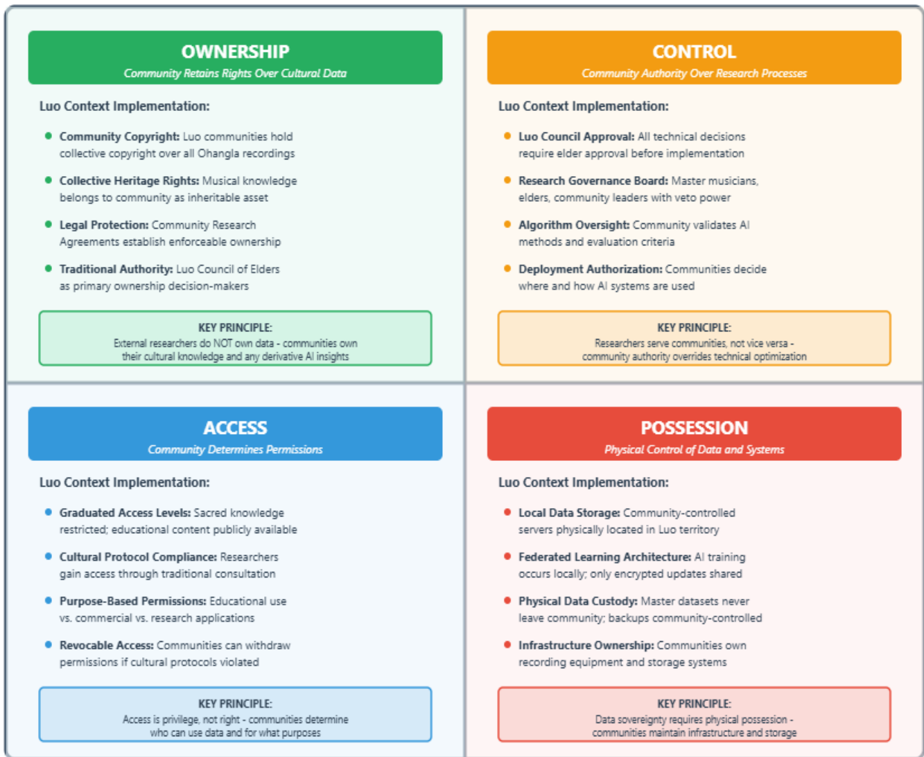
Figure 3: OCAP® Principles Implementation Framework